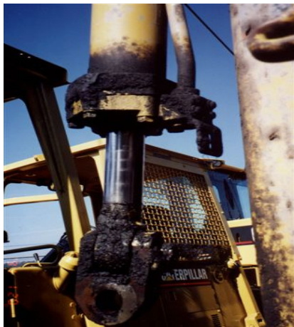
HIGH BUSINESS RISK

The patented* "SEAL SAVER"* opens and closes like an accordion as the cylinder works. It keeps dirt, sand and grit off the rod, which cause scoring and damages the seals. The hidden feature of the product is that it keeps the silt-sized particles from entering the hydraulic system via the rod seals and contaminating the system. These silt sized particles, once in the system, act like a lapping compound. This build up begins the wear process on valves and pumps. As most people know, 70% of hydraulic system failures are caused by contamination (dirty oil). Stop the ingress of contaminates and your oil filter can do it's job (keeping the oil clean).